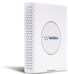
W-AIR Sync Plus