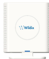
W-AIR Base Small Business