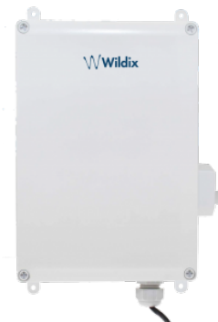
W-AIR Base Sync Plus Outdoor